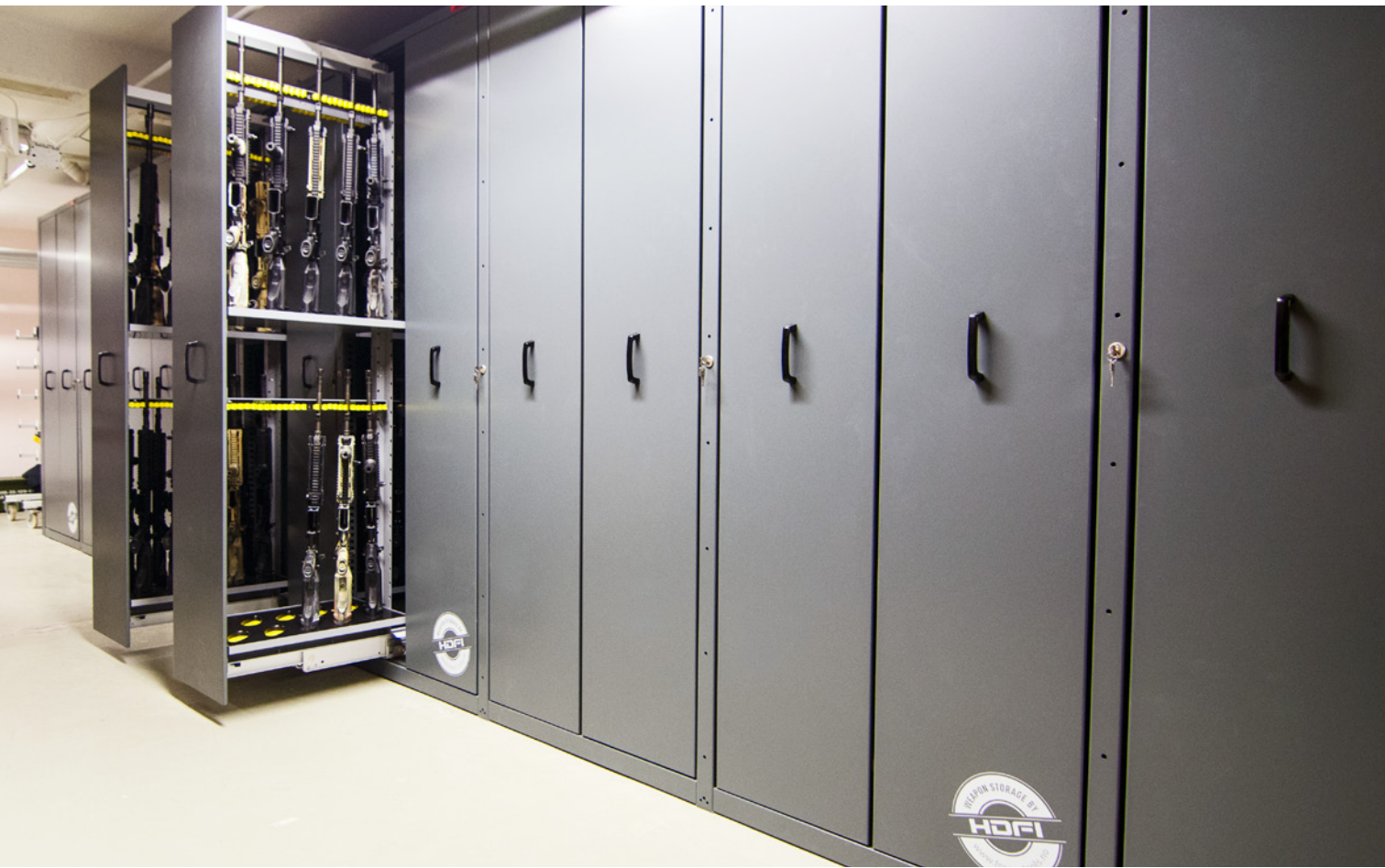
Example: 16pcs HK 416 fitted in two heights in each vertical drawer.

Colour: Our standard colour: Grey Metallic NCS S 6502-B. 12 standard colours available. Multi-colour paint also possible. Customized colours on request.